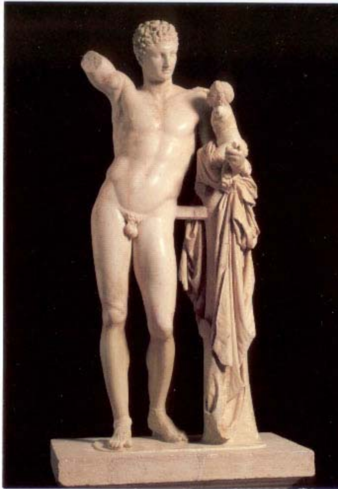
Praxiteles, Hermes and Dionysus , c. 340BC. Marble (213 cm high) (Olympia)