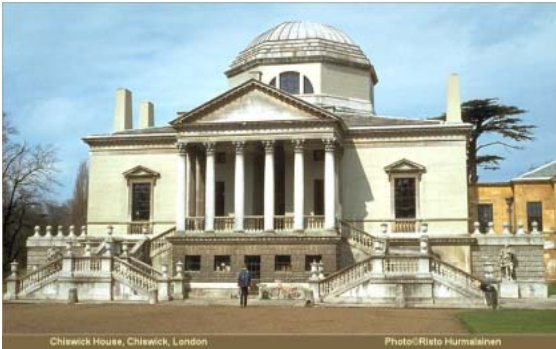
Lord Burlington and William Kent, Chiswick House , 1729 (stone) (Chiswick, London)