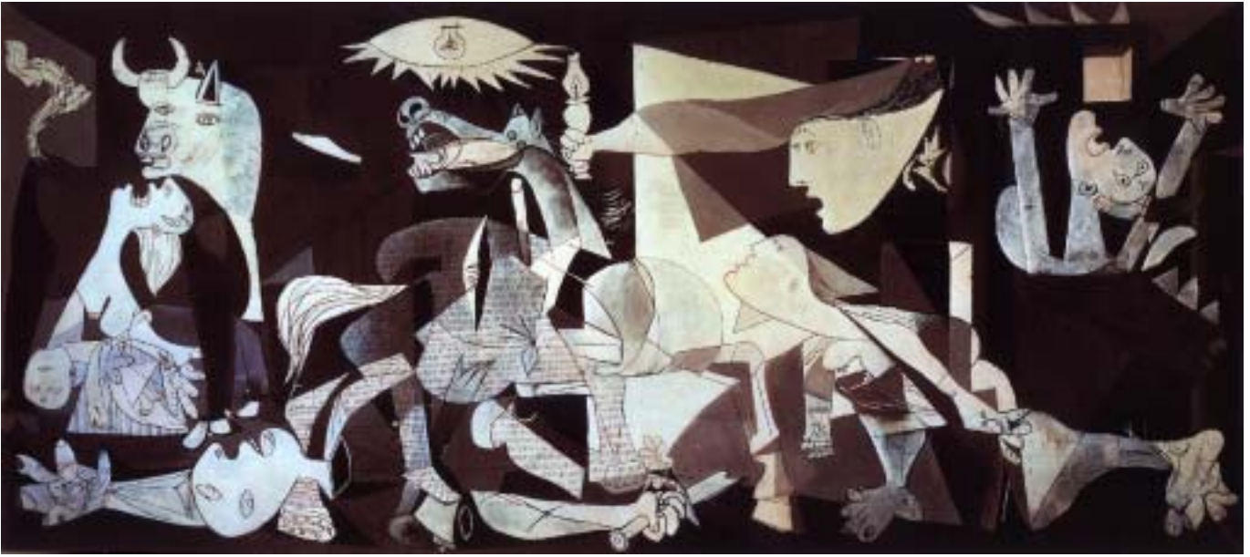
Pablo Picasso, Guernica , 1937 (oil on canvas) (349.3 x 776.6 cm) (Museo Reina Sofía, Madrid)