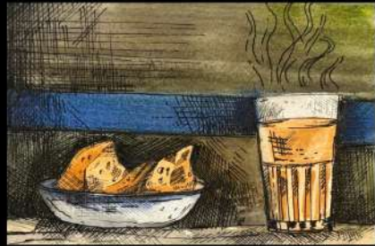
Fig 3.7 Fig 3.6, 3.8 I tried to incorporate the same essence of my utmost craving in the rain. Replicating the craving and satisfaction of hot tea and samosa during monsoon, I have used using poster colours on hot pressed paper to achieve a completely realistic image.

The following examples show how candidates may wish to present their screen pages. This list is not exhaustive and there is flexibility in organising screen pages, provided the content and any included annotation is clear and legible.