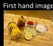
First hand image