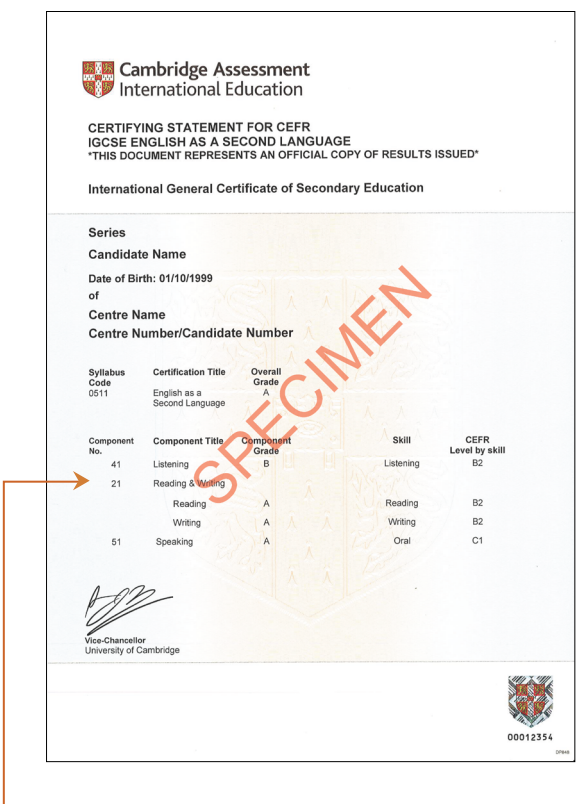
Breakdown of grades by component

There is a charge for this service – further information can be found on our website at: www.cambridgeinternational. org/Images/183804-certifying-statement-application-for-cefr-results-and-certificates-form-11.pdf