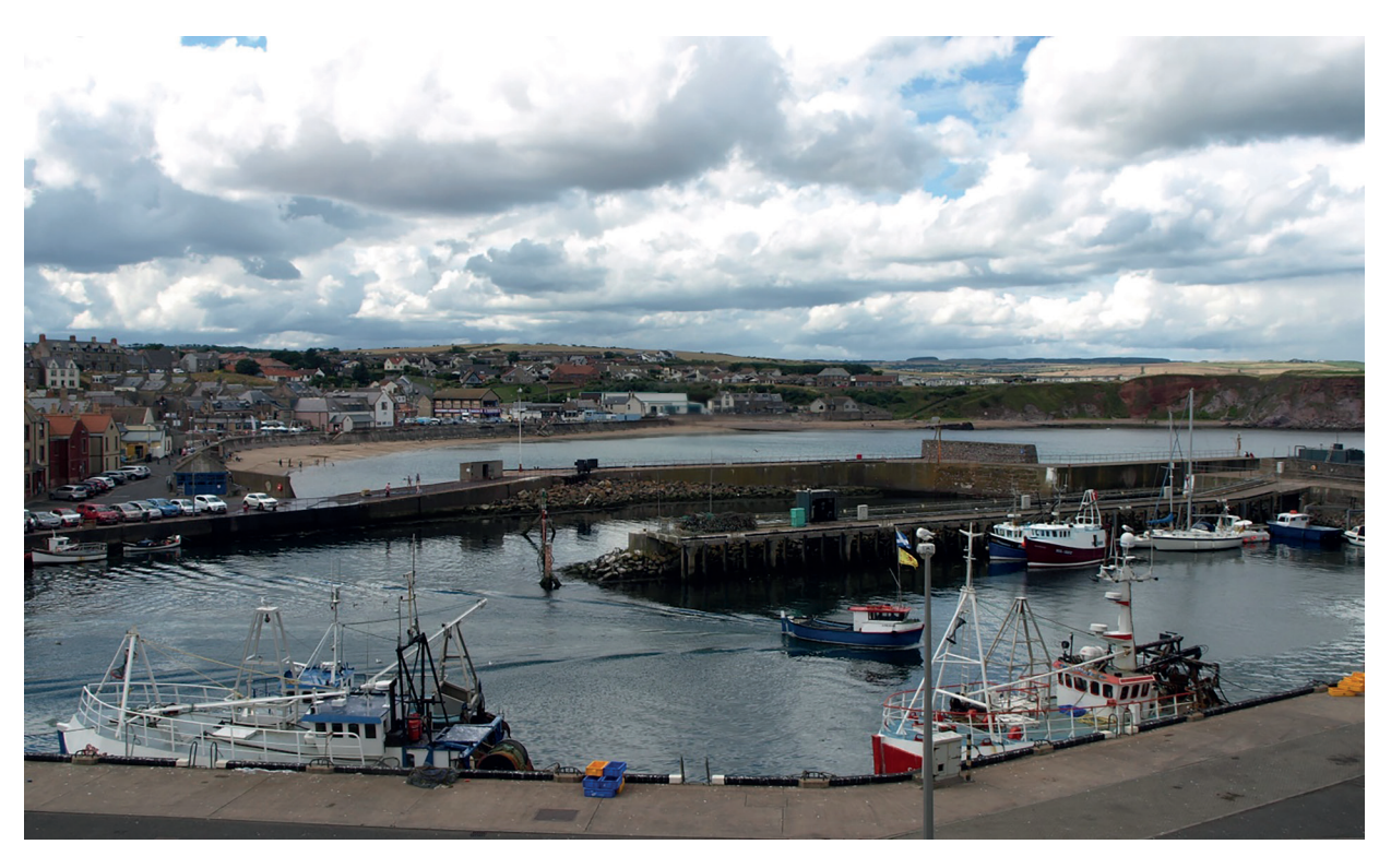
Fig. 4.1 for Question 4