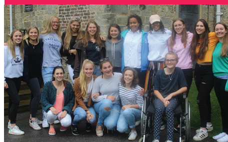
Results day celebrations at Mayfield School