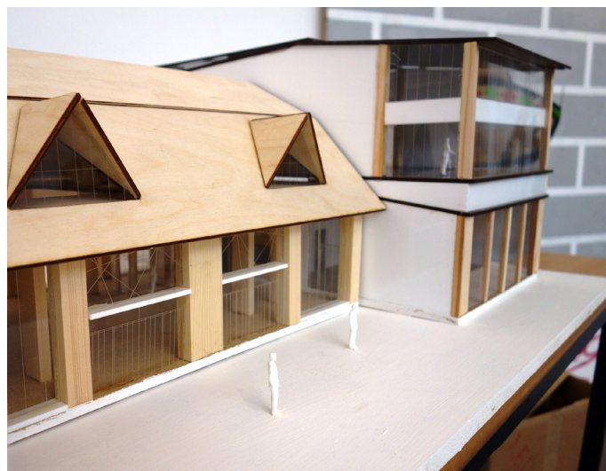
A project by a Cambridge Pre-U Art & Design student at Rugby.

Since Rugby started to offer more tailored pathways through Cambridge Pre-U Art & Design, around four years ago, student numbers have grown dramatically: 'From around 10 students in the first year we've grown to a cohort of about 50, with students focusing on