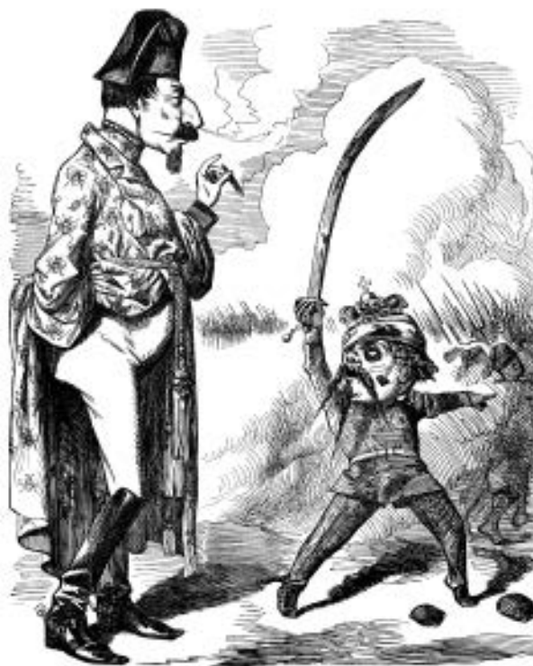
THE GIANT AND THE DWARF.

A cartoon published in Britain in June 1859. Napoleon III, on the left, is saying to King Victor Emmanuel, 'Bravo, my little fellow! You shall do all the fighting and we'll divide the glory.'