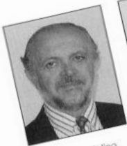
Mario J. Molina