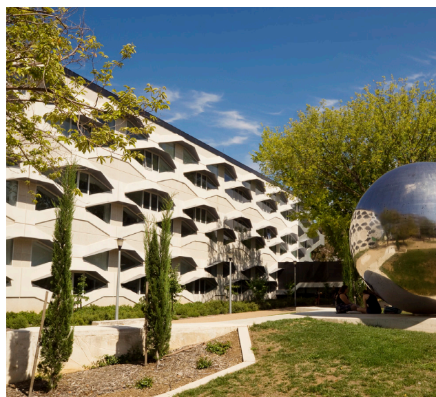
Australian National University – Canberra

You should carefully check student visa information on both the Department of Immigration and Border Protection ( www.border.gov.au ) and the institution websites for English language requirements.